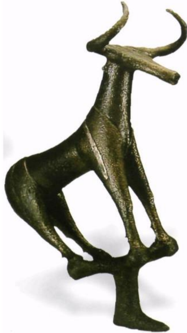
Bull statuette / Boğa heykelciğı Arsenical copper / Arsenikli bakır, H / Y 48, Alaca Höyük-Çorum 25 th c. BCE / MÖ 25. yy Anadolu Medeniyetleri Müzesi-Ankara