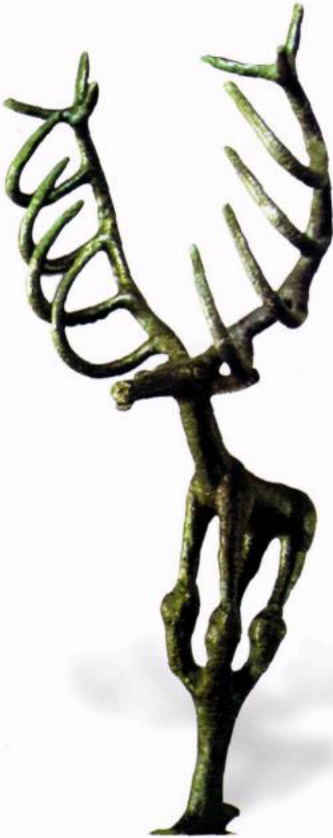
Deer statuette / Geyik heykelciğı Arsenical copper / Arsenikli bakır, H / Y 45.5, Alaca Höyük-Çorum 25 th c. BCE / MÖ 25. yy, Anadolu Medeniyetleri Müzesi-Ankara